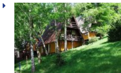
BRDA II - BR6