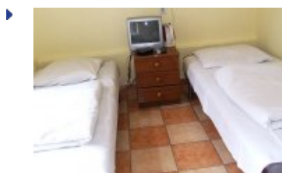
BRDA II - BR6